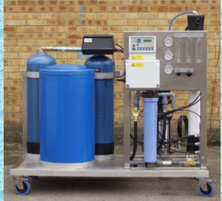
Duplex 30 litre softener, 250 lph RO