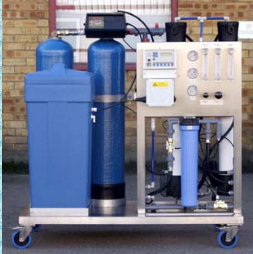
Duplex 30/40 litre softener, 600 lph RO