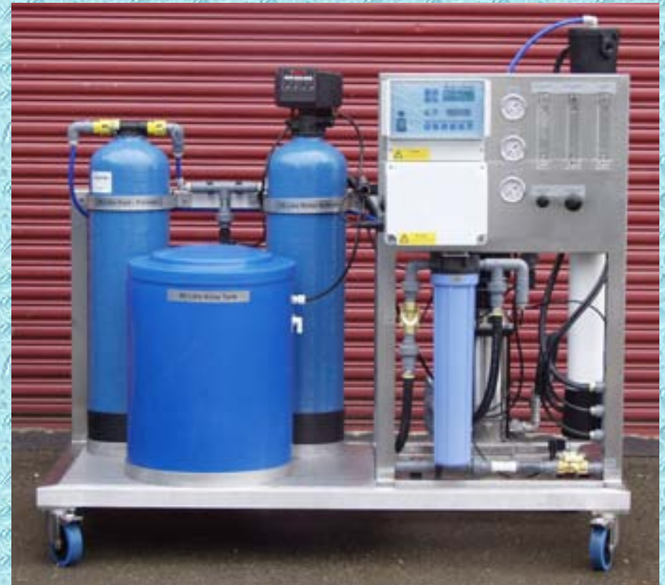
Above: Simplex 25 litre softener, 200 lph RO with 25 litre polisher Left: Duplex 50 litre softener 1200 lph RO